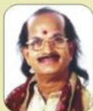
Dr. Kadri Gopalnath